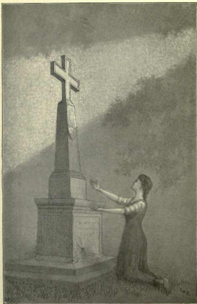
“JOAN . . . DROPPED ON HER KNEES BEFORE THE CROSS” (See page 280)